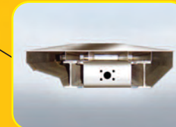
630mm width platforms with reinforced sub-structure