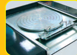
recessed radius plates